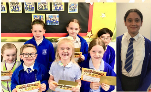
Gold Award Winners